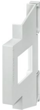
проставка 0,5 мод.