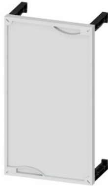
ALPHA 400/630 DIN, монтажный комплект для фальшпанелей с опорами, В = 450 Ш = 250