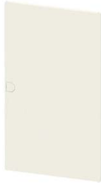
SIMBOX PC, настенный распред. щиток пластиковая дверь белого цвета 3-рядн.