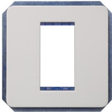
DELTA profil, цвет: титановый белый модульный держатель, 1x вкл. промежуточную рамку винтового крепления