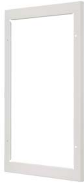
SIMBOX 63, промежуточная рамка 2-R для устройств 70 мм в распред. щите N